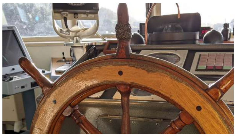
Helm of the Tustumena