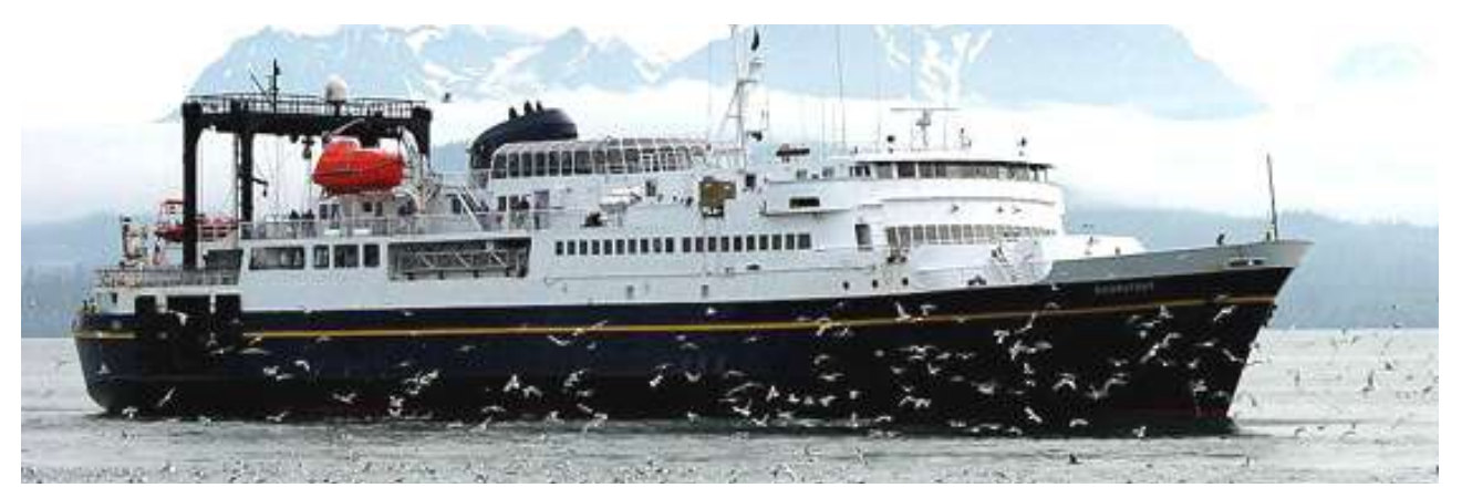
Tustumena leaving Homer, Alaska